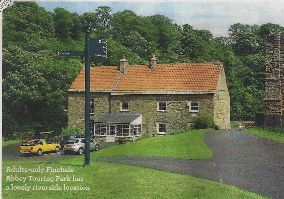
Adults-only Finchale Abbey Touring Park has a lovely riverside location